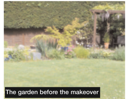
The garden before the makeover